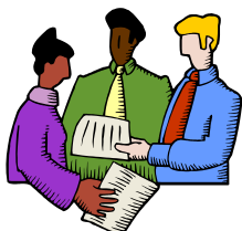
We hope to have HLC members from each subdivision.

The Homeowners Liaison Committee (HLC) is a very important part of your Association. The Committee is made up entirely of homeowners and is a way in which homeowners can have a voice within the community. The HLC meets: